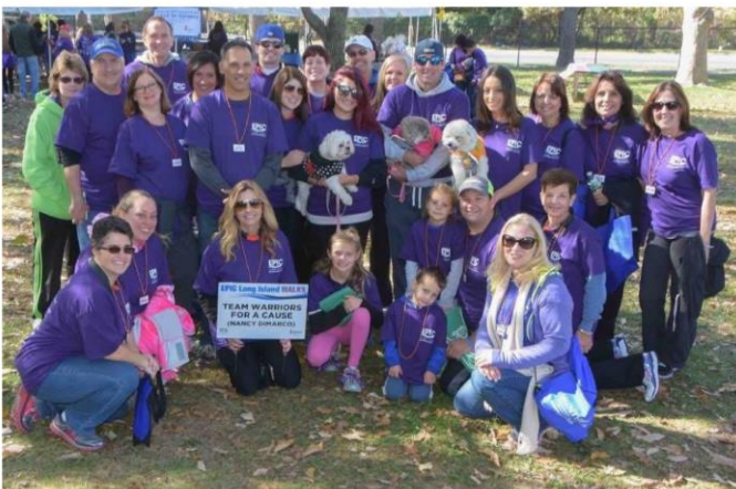
2016 Epilepsy Foundation Walk