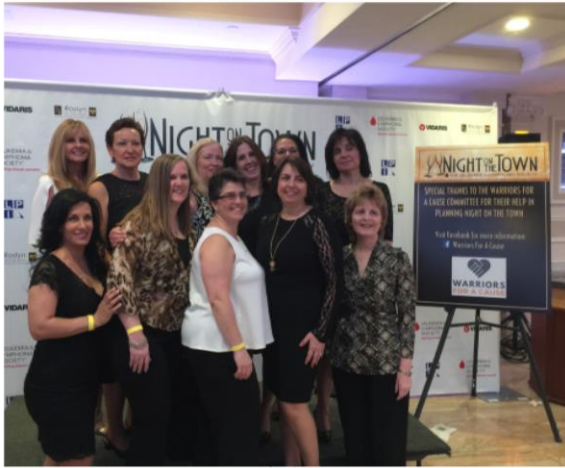
2017 Night On The Town For The Leukemia Lymphoma Society Gala