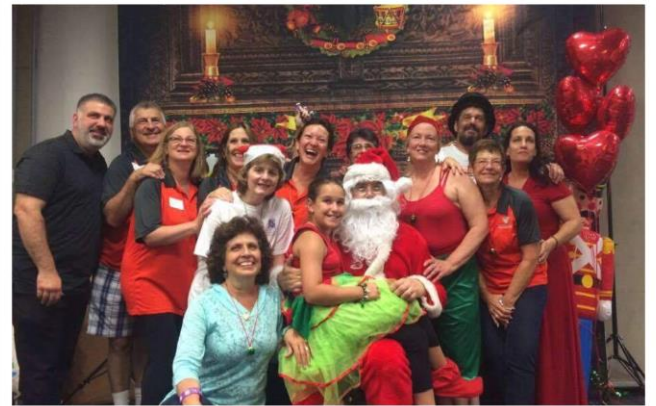
2016 Carly Rose Foundation Christmas In July