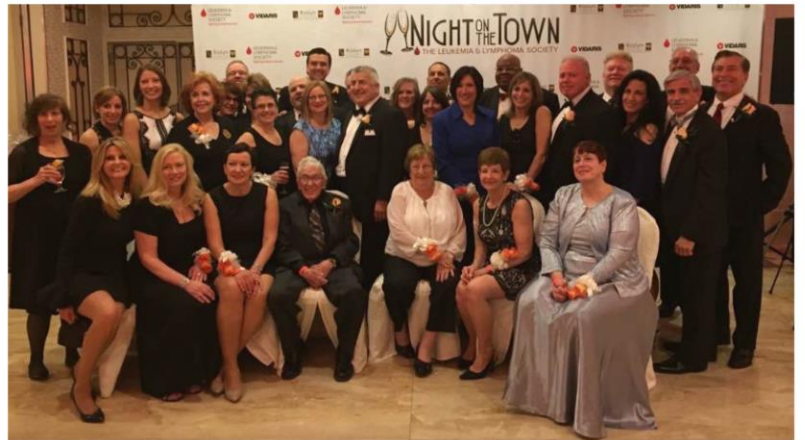
2016 Night On The Town For The Leukemia Lymphoma Society Gala