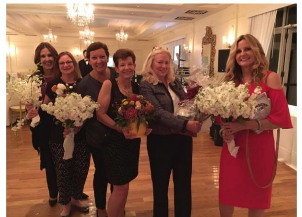
2016 Michael Magro Foundation Gala