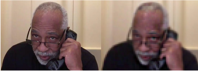
Figure 3. Visual acuity is important for human communication.

their bodies. It's an accountability thing, and lets people on the outside get some read on the physical condition of a loved one." 20