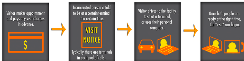
Figure 1. Most companies, including Securus, Telmate, and Renovo/Global Tel*Link, charge for a set amount of time and require pre-scheduled appointments.

How do video visitations work? While video visitation systems vary, the process typically works like this: