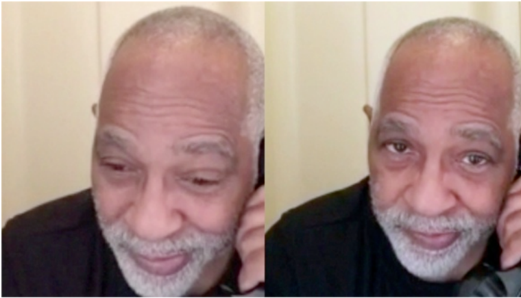
Figure 4. This image is from a video demonstrating that eye contact is important for human communication. (For the video, see http://www.prisonpolicy.org/visitation/report.html )