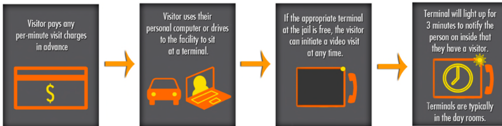
Figure 9. TurnKey charges per minute and allows the visitor to call into the facility without an appointment.

Two companies, Turnkey and HomeWAV, structure their systems differently than the market leaders and structure them more like phone services. Both charge per minute rather than per visit, and neither company requires families to pre-schedule video visits: