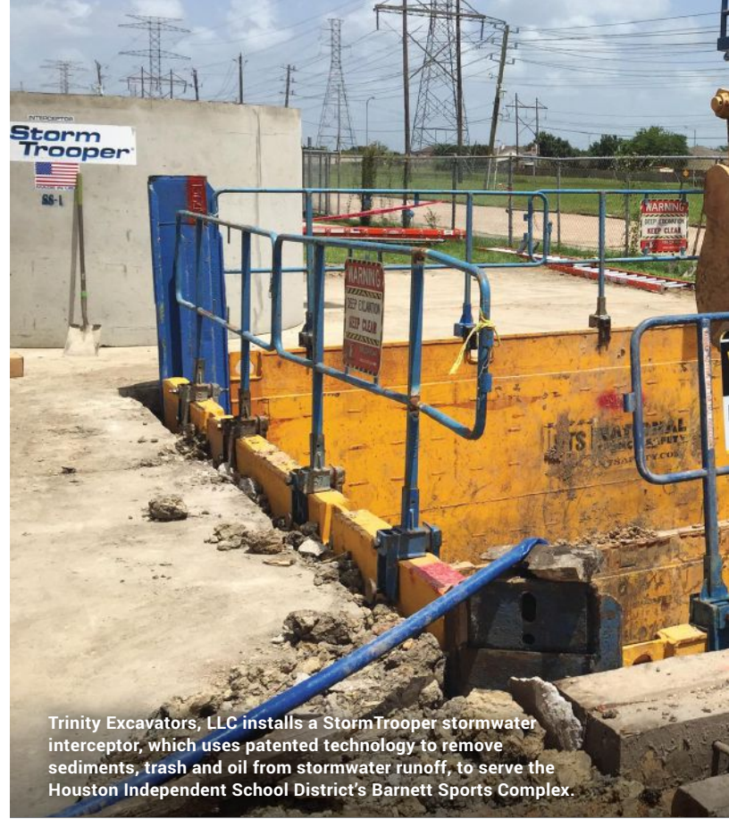
Trinity Excavators, LLC installs a StormTrooper stormwater interceptor, which uses patented technology to remove sediments, trash and oil from stormwater runoff, to serve the Houston Independent School District's Barnett Sports Complex.

“Keeping every team member and our job sites safe is essential. We live this, breathe it and insist on it.”