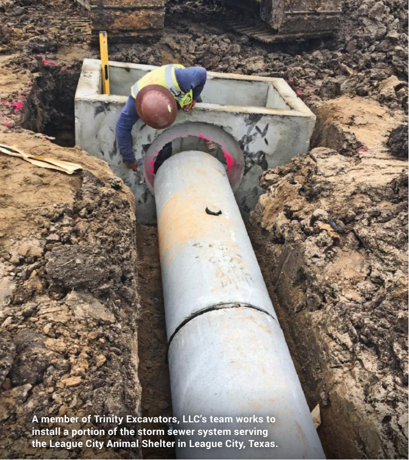
A member of Trinity Excavators, LLC's team works to install a portion of the storm sewer system serving the League City Animal Shelter in League City, Texas.