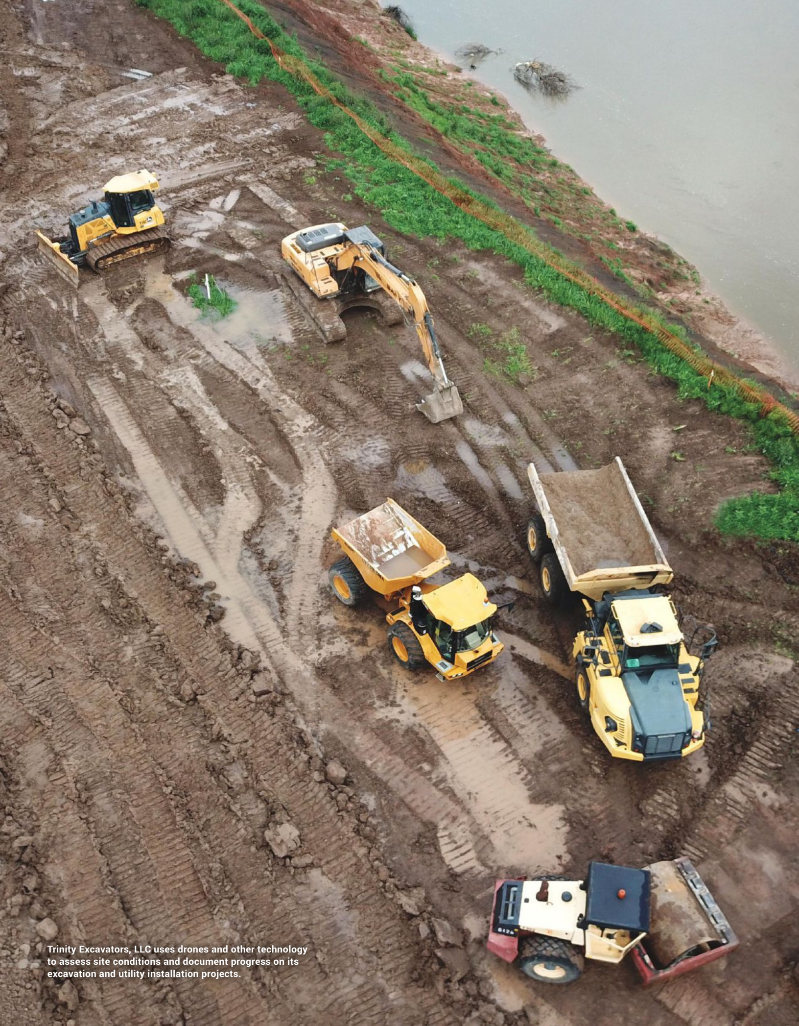
Trinity Excavators, LLC uses drones and other technology to assess site conditions and document progress on its excavation and utility installation projects.