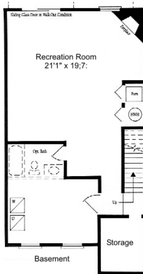
Basement without Garage