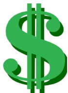
2021 Spring Fundraiser is Underway