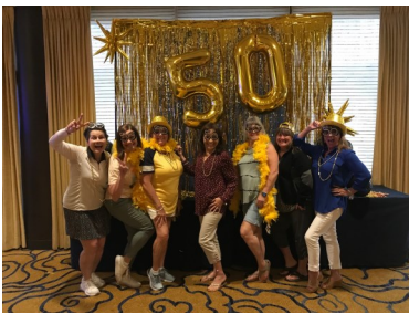
Region 2 State Judging Directors and Regional Judging Director