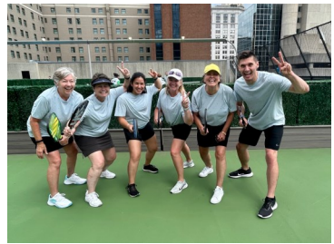
Region 2 Pickleball Team