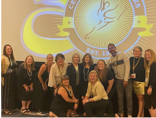
Oregon NAWGJ Delegation

A dozen of our Oregon judges gathered to learn, meet new friends, honor our colleagues, and have fun at the 2023 NAWGJ Symposium, held in Grand Rapids Michigan in July. Dozens of lectures were offered over the two-day symposium, with topics ranging from professionalism, safe landing techniques, to beginning shorthand. Because of your fundraising efforts, members were reimbursed up to $1400 for travel expenses. Here are some pictures of all the fun we had!