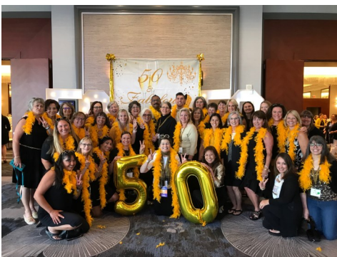
Region 2 Delegation