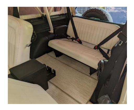
* Please note – Disruptive Restomods LLC does not cover any claims for damage