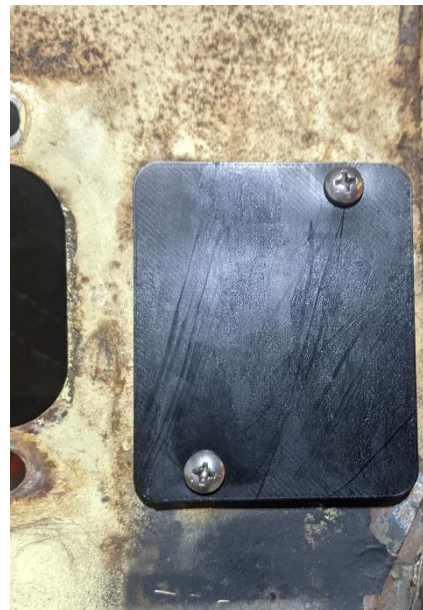
View from inside vehicle