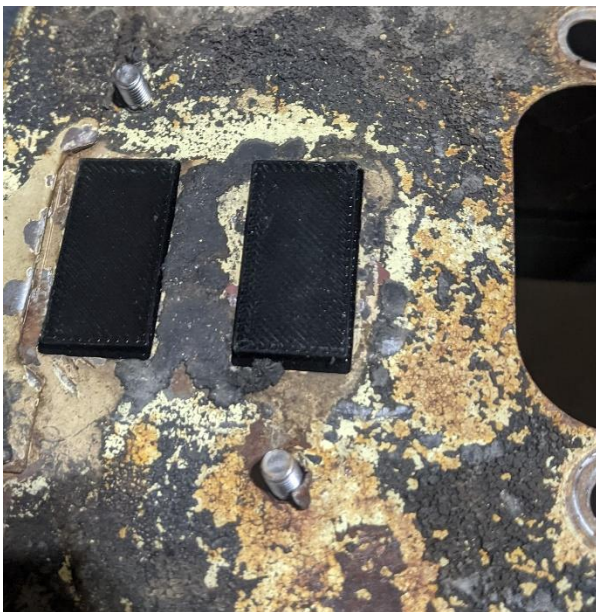
View from engine bay

2. Position Plug so its protrusions fill the rectangular holes in the firewall and use (2) #10-24 x 3/8" screws to tighten Plug to the firewall.