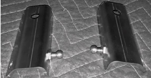
Passenger side Fender Support