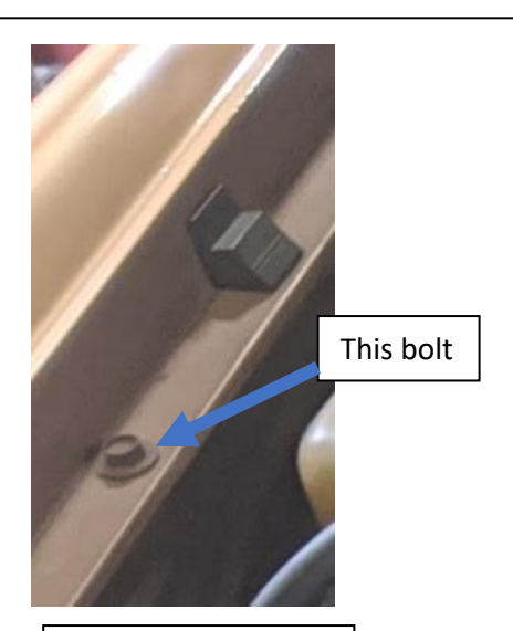
Fig A - Passenger side shown (From page 1 Step 3)