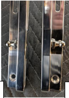
Passenger side Hood Support