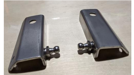
Passenger side Fender Support