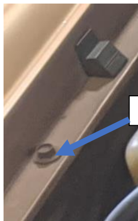
Fig A - Passenger side shown

23. As a reminder always open and close the hood from the front of the vehicle.