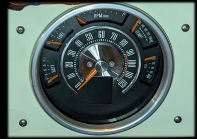
Early Bronco Gauge Bezel (66-77) 1/2" thick Billet Aluminum

Gas Caps are made from Billet Aluminum & have a larger diameter than the stainless gas caps, so it hides the filler neck screws. Comes fully assembled.