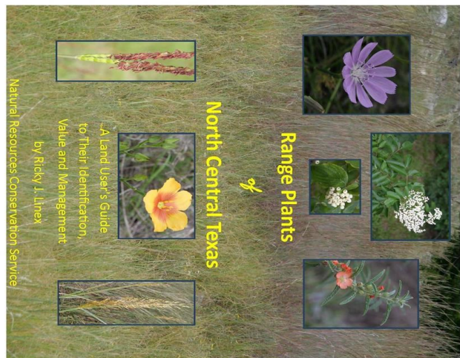
Natural Resources Conservation Service