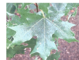
The shape of the Caddo Maple leaf is distinctively different than our local Big Tooth Maple.

We have teamed up with a grower in Southwestern Oklahoma to provide a Caddo Maple suitable for here in the Hill Country. We should have some 5 or 30 gallon ones ready for sale next Fall.