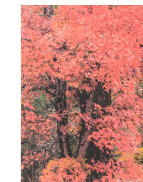
Caddo Color— This tree is located in the Red Rock canyon area where they are native in Caddo County Oklahoma.