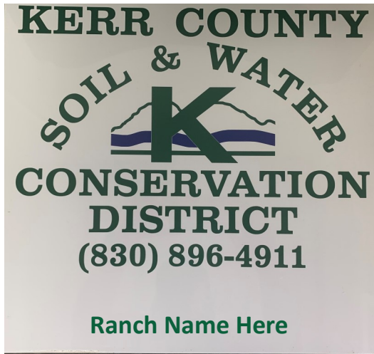
Gate Sign 15"x16" $40.00