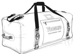
Yoosure Waterproof Bag