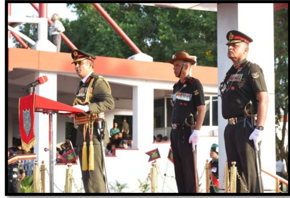
Passing Out Parade