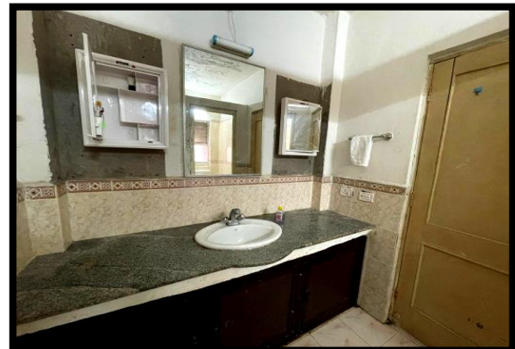
Cadet's Model Room

(b) Yodha Cadets' Mess. Yodha Cadets' Mess caters for the meals and other nutritional needs of the entire Academy. Cadets are provided all three meals at the Mess at laid down timings as per schedule. In addition to the meals, the mess provides the bed tea, morning tea and refreshments in the afternoon to the cadets at their respective company locations.