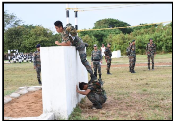
Cadets during Sports and Obstacle Training