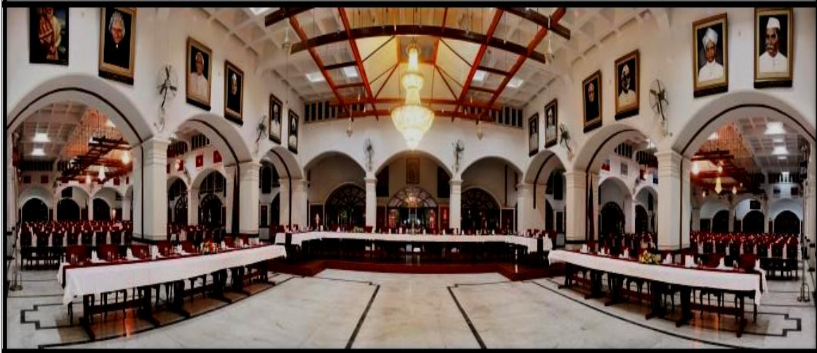
An Inside view of Yodha Cadets' Mess

(c) Amenities. The Academy has the following facilities within its premises and is in the process of further improving the quality of life of cadets :-