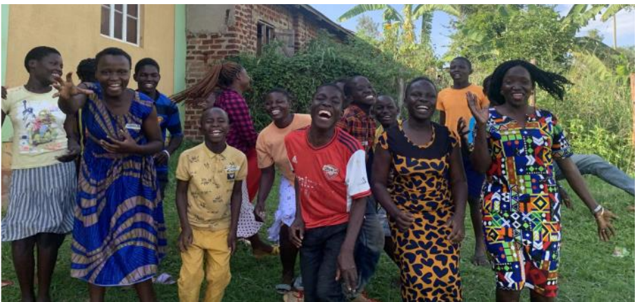
Young and Alive! -The science of adolescence and its impact on teenager's decision making and behavior.