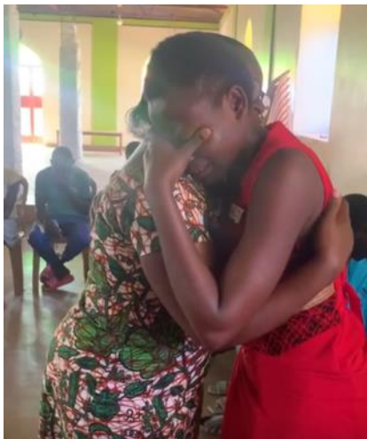
Trauma Healing - Understanding trauma and problems associated with trauma.