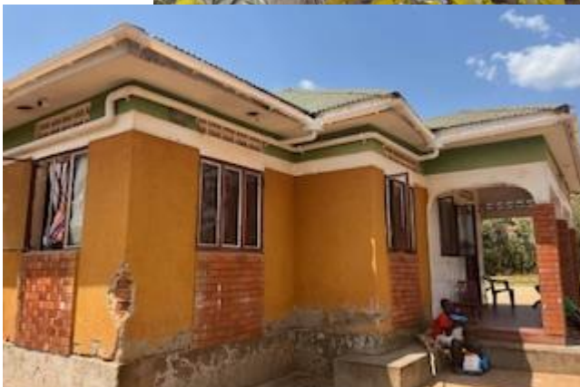
New Guttering System around the whole building.

For a long time I have wanted to incorporate a learning center that helps with the kids education, development, and motor skills. We were able to begin this process on this trip. This is “El Roi” (The God Who Sees Me) Sensory Center .