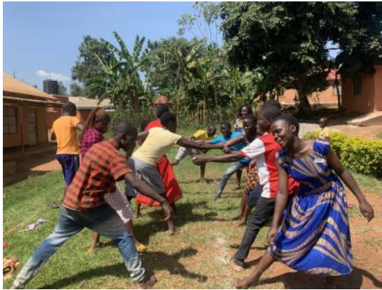
Encountering the Father's Heart.