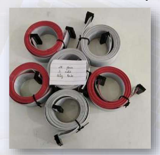
Flat Ribbon Cable Assembly