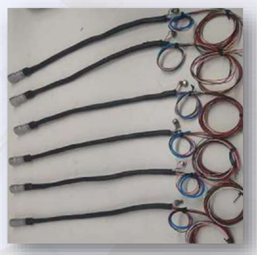
Lemo Connector Assembly