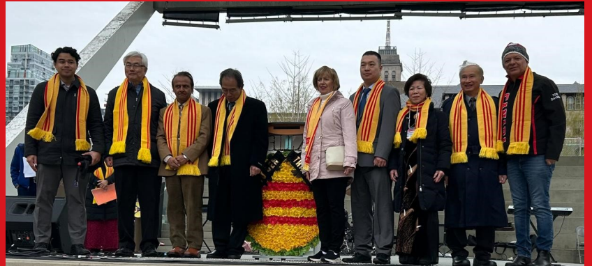
Journey to Freedom Day Commemoration with the Vietnamese Community