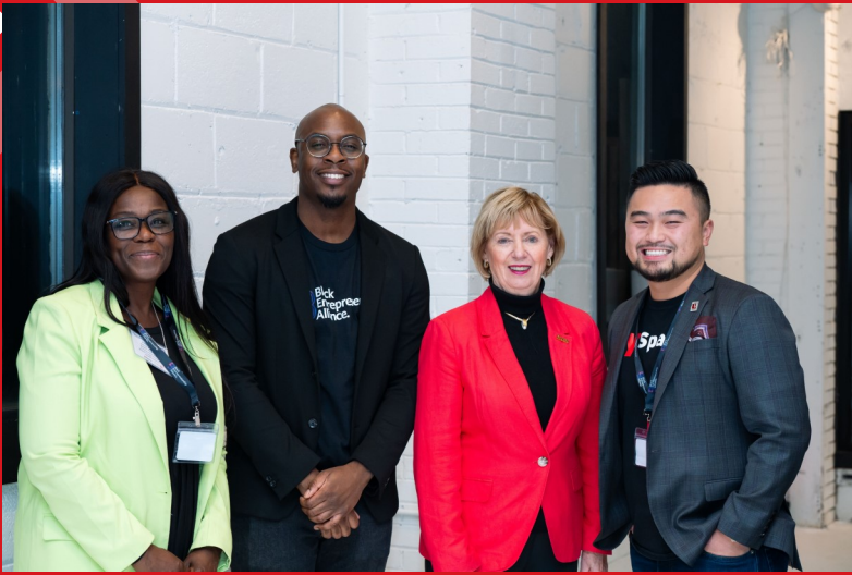
At the Investment Bootcamp Demo Day from the Black Entrepreneurship Alliance