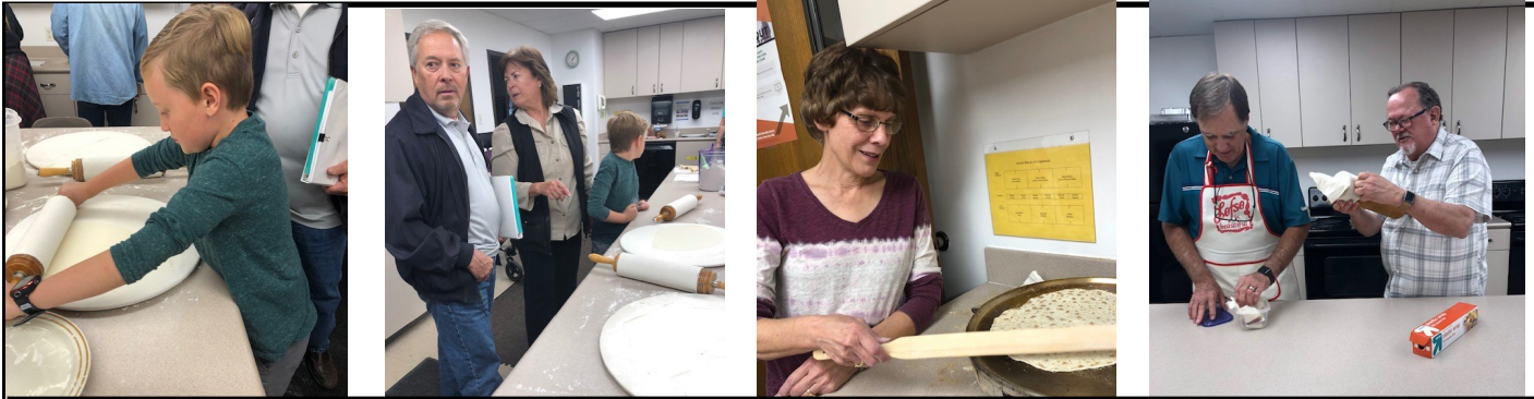
Lefse Making Fun!