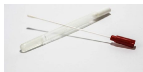
Saline Swab (provided)

No supply issues – Can produce 100,000 or more assays per order