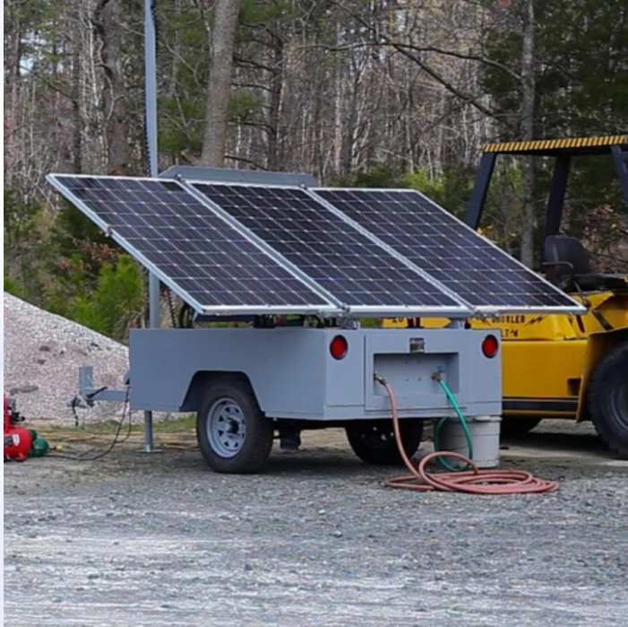
CM4 SHOWN WITH OPTIONAL INTEGRATED WATER SYSTEM

MAINTENANCE CREWS • CAFES & KIOSKS • FILM PRODUCTION