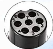
7 PIN 5A 150V