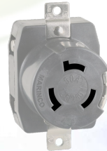
Marinco 125/250 50A