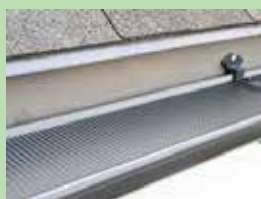
Sample of gutter guard