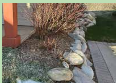
Existing Large Rocks