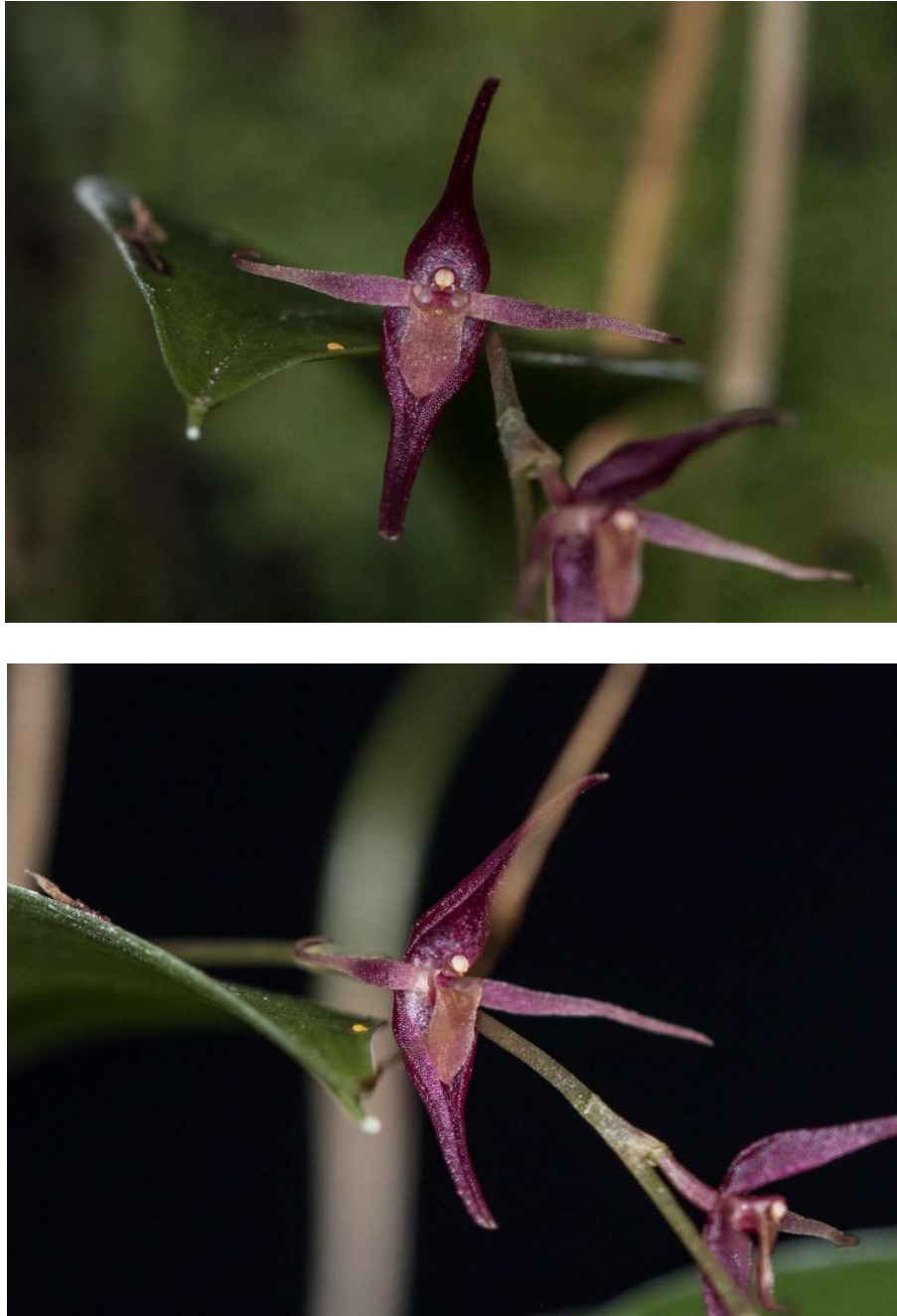
Fig 3. The dorsal sepal and synsepal of Pleurothallis tomtroutmanii form a tight tube giving the flowers a very slender appearance. Photos taken of the plant used to prepare the holotype material.