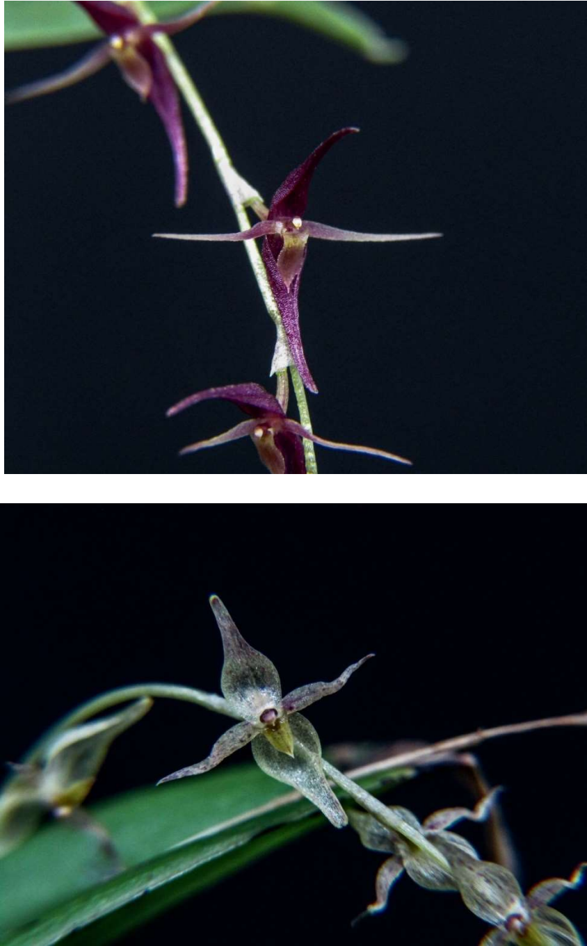
Fig 4. The slender flowers of Pleurothallis tomtroutmanii (top) compared to the rather robust flowers of Pleurothallis tyssa (bottom). Photos taken of plants grown by the author, including the plant used to prepare the holotype material.