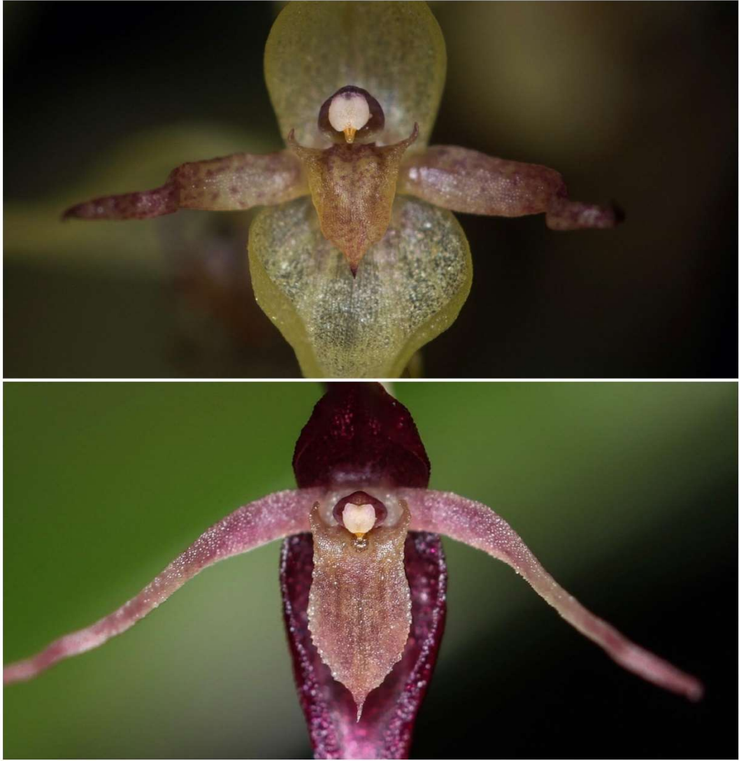
Fig 2. Comparison of the lips of Pleurothallis tryssa (top) and P. tomtroutmanii (bottom). Photos taken of plants grown by the author, including the plant used to prepare the holotype material.