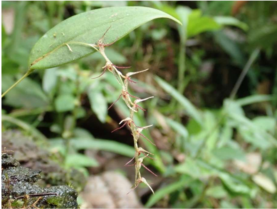
Fig 5. Pleurothallis tomtrotmanii observed in situ January 2019.