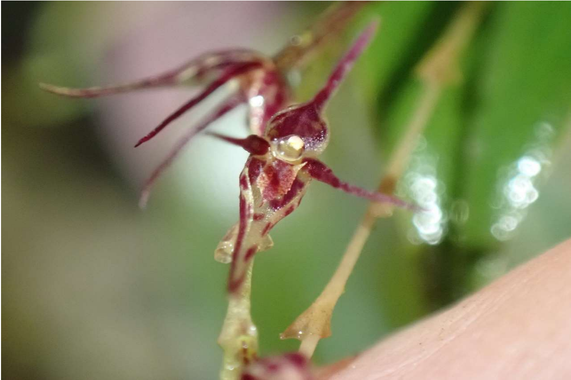
Fig 6. Pleurothallis tomtroutmanii observed in situ January 2021.