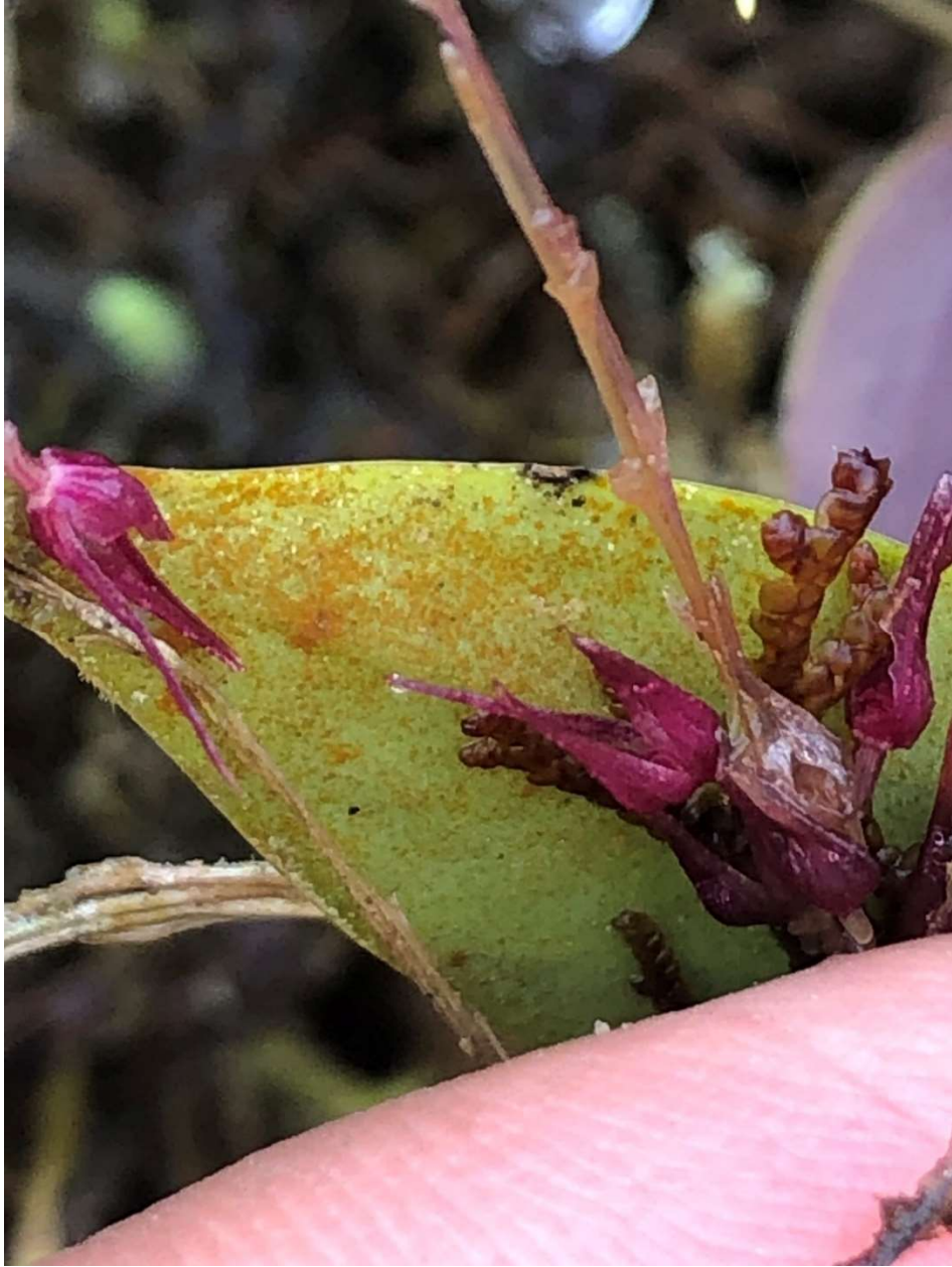
Fig 7. Pleurothallis tomtroutmanii photographed in situ January 2021. This is the only field observation of a specimen with the dark purple color of the holotype. This plant was growing within the same population in Fig 6. above. The dark purple color of the holotype must be atypical for the species.