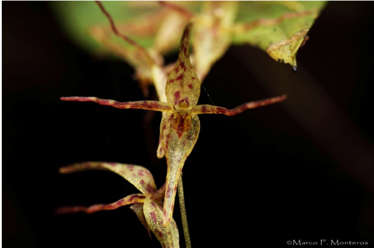
Fig 8. Pleurothallis tomtroutmanii photographed in situ July 2021.