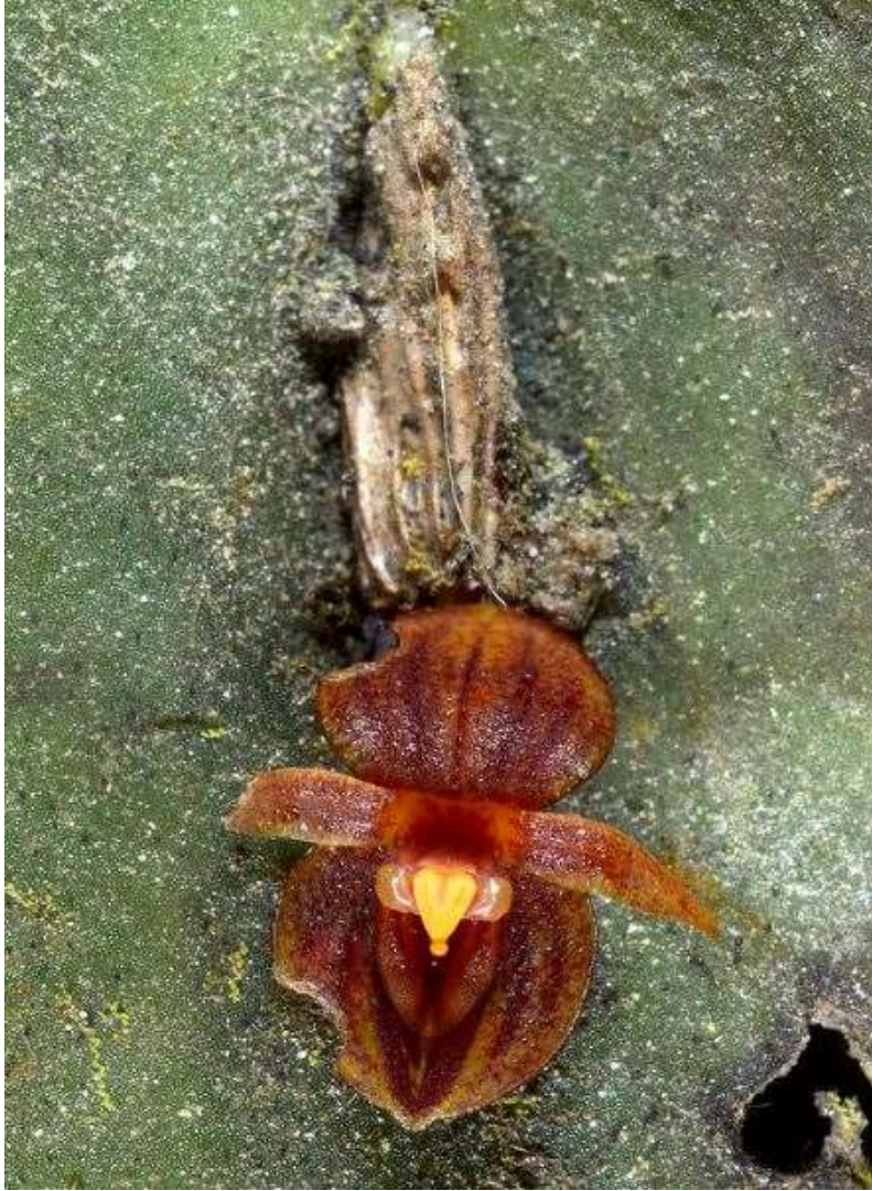
Fig. 2. Pleurothallis equipedites photographed on a roadside between Zamora and Loja, Ecuador, December 6, 2013.