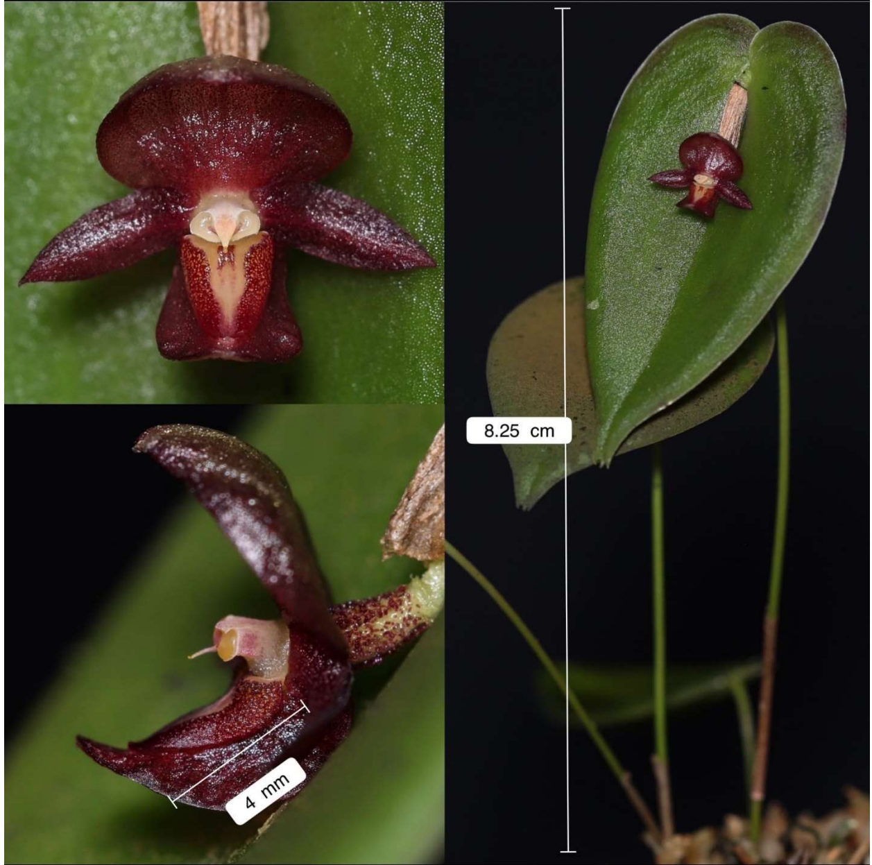
Fig. 1. Pleurothallis pseudosphaerantha Photos taken of the same plant used to prepare the holotype material.