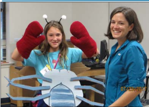
Beaufort SWCD presented their 28th Eco Camp, Nightly News, focusing on nocturnal animals and the night sky.