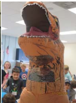
Middle: An "extinct" T-Rex makes a rare appearance!