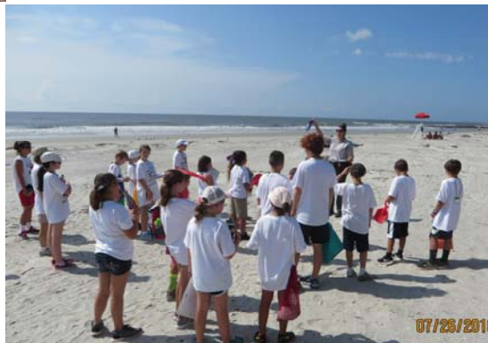
Above, right: Hunting Island State Park staff lead campers in learning about loggerhead sea turtles. Above, middle: Campers learn and demonstrate how to inventory a sea turtle nest.