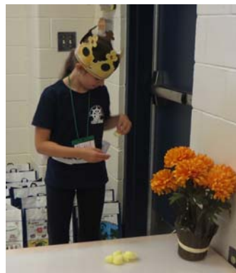
Right: .Students do Project Wild "Hazardous Links" activity while learning about availability of foods for certain species.