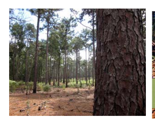
MICRO IRRIGATION Conserves water, saves energy & prevents nutrient run off

Invasive species like Chinese Tallow choke out crops & native species that support wildlife