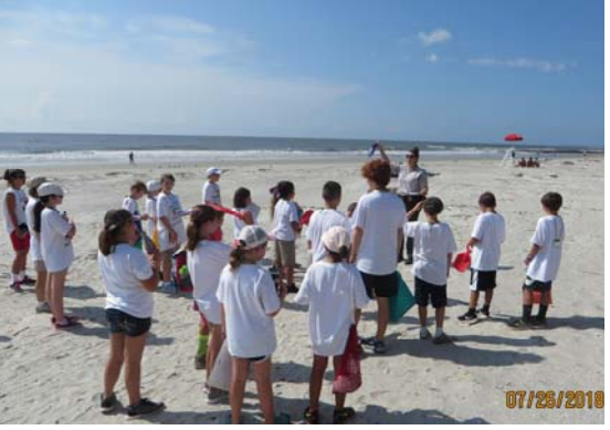
Above, right: Hunting Island State Park staff lead campers in learning about loggerhead sea turtles. Above, middle: Campers learn and demonstrate how to inventory a sea turtle nest.