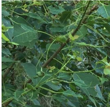
Extends the Growing Season