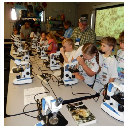
Right: Campers use microscopes to investigate organisms that live under the docks at The Port Royal Sound Maritime Center.

Info about our 2020 Eco Camp will be on our web site next Spring!