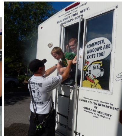
Right: The Beaufort/Port Royal Fire Department showed campers how they can escape a burning building.