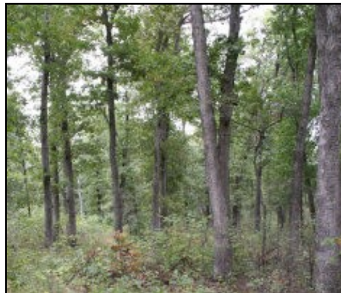
Pollinator Habitat Management