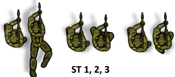
ST 1, 2, 3

Load: 3 Mags x 9 Rnds, 3 x 1, 1 x 4, 1 x 6