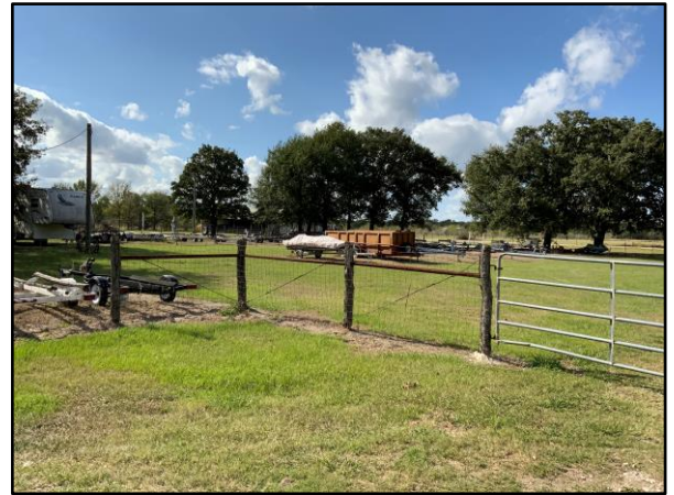
Storage lot is lookin' good

In the past we have waited for workdays to mow and weed eat the storage lot and cleanup the front entrance. Unfortunately, by then it is a big job. This year we asked for volunteers to "police" the storage lot and the front entrance each month. Our volunteers did a great job, and their efforts will make the upcoming workday a little bit easier. Thanks to all that participated.