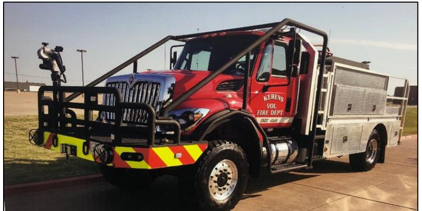
Brush truck like the one to be purchased