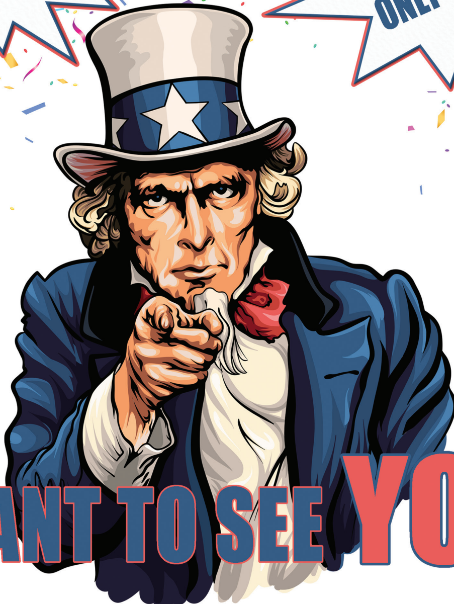
TABLE OF 10 ONLY $250