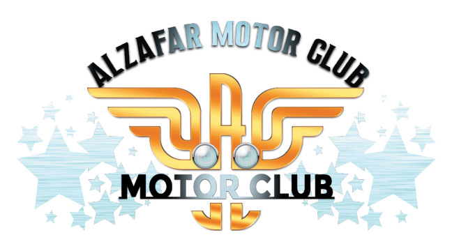
ALZAFAR MOTOR CLUB

Here we go, another year behind us in the rear view mirror and a new one facing us in the wind shield. From the last parade in December, to the first scheduled this year, there are eight weeks. That seemed like plenty of time to get needed maintenance, updates and upgrades and a thorough cleaning and polishing completed. Now the time is passing faster than the check off list can be accomplished. Thankfully the Fez worn during parades and special events hides the newly acquired gray hairs that have come to light fretting over getting everything done.