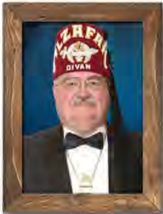
Alzafar Shrine 2024 Chief Rabban Elect

I certainly hope everyone had a great Winter holiday; I know I had much needed quality time with my family. With the new year starting and my new position as your Assistant Rabban, I am looking forward to continuing to represent Alzafar Shrine. We have a very busy year ahead of us with the Hospital Gala on May 4th, the Shrine Midwinter, the Imperial Session, and so many other things happening around the Shrine.