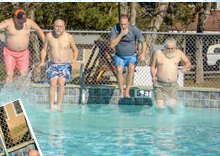
Scrambling to preserve any heat left in our bodies