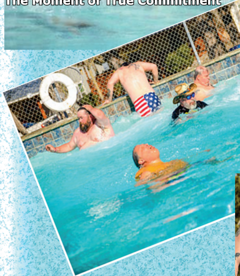
Superheroes were on hand: Flag Jockey & El Jefe de la Lucha Libre! (AKA: The Illustrious One)