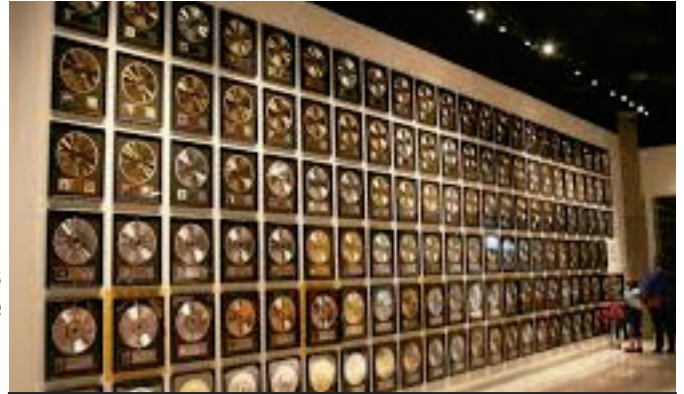
Hall of Fame

All of the names above are your brothers, who have passed away to eternal east long ago leaving us with their unforgettable deeds, and: All of them are Freemasons.