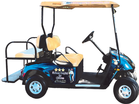
Used Golf Cart Raffle

Until next month keep your powder dry and remember as long as there is lead in the air, there is hope!