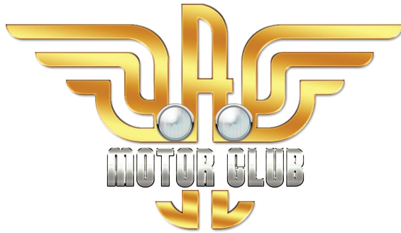
Alzafar Motor Club

Well, it seems as though the heat of summer is a passing memory, whew!