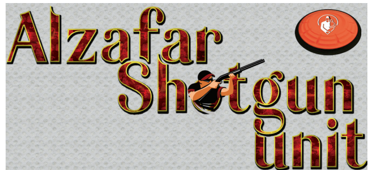
ALZAFAR SHOTGUN UNIT AKA SMOKIN' CLAYS