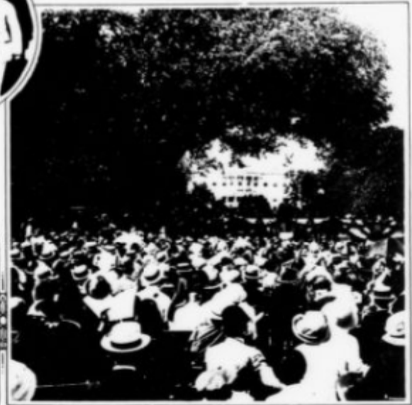
One of the greatest crowds that ever gathered in the neighborhood of the White House attended the unveiling of the Zero Milestone. This photograph gives an unusual view of the crowd and White House through trees.