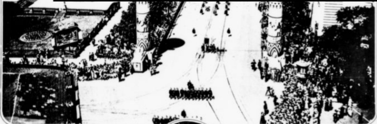
Parade passing through the Garden of Allah, the final goal of all Shriners pilgrims to Washington. United States Treasury on the left.