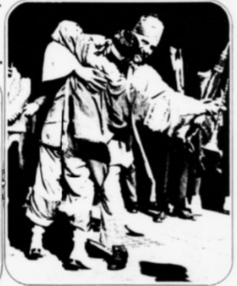
Just an incident of the big Shriners parade. Two dancers from one of the far western temples show a few Chinese steps on the pavement.