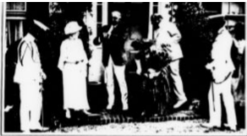
Did the President lose his speech? Anyhow, the picture would give that impression. Scene at dedication of "Home, Sweet Home," south of the Treasury. President Harding was presented with the key and he literally opened the home.