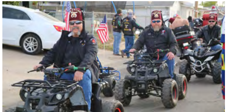
Desert Knights wowed the crowd in Laredo 2.18.2023

Greetings to all from the Desert Knights. Hope everyone had a safe and joyful Easter weekend last month. Can't believe it's May already. We're in full parade mode with events like the Poteet Strawberry Festival, San Antonio Fiesta Flambeau and Helotes Cornyval. With these exciting events, good ole backyard barbecues and fellowship with family and friends...It's a great time to be a member of the Alzafar Shrine.