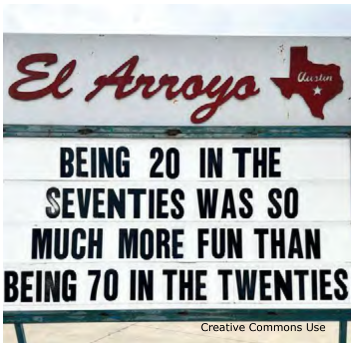
Creative Commons Use