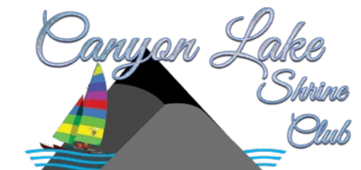
Canyon Lake Shrine met September 15th at Goofy's Grill after being Dark from June-Aug.

Please come to Alzafar's next event and find out why I say "Alzafar Rocks."