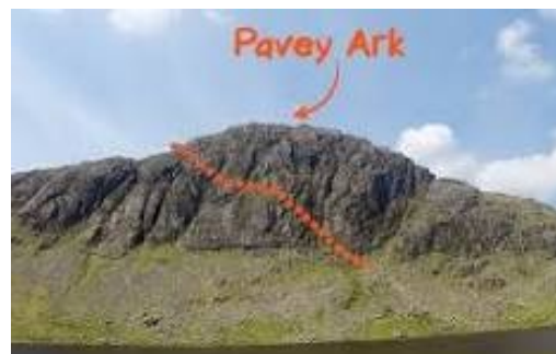
Jack's Rake route up Pavey Ark

Required map: OS 1:25000 Outdoor Leisure 7: English Lakes SE Area (+ / - 5 & 6 depending on route chosen)