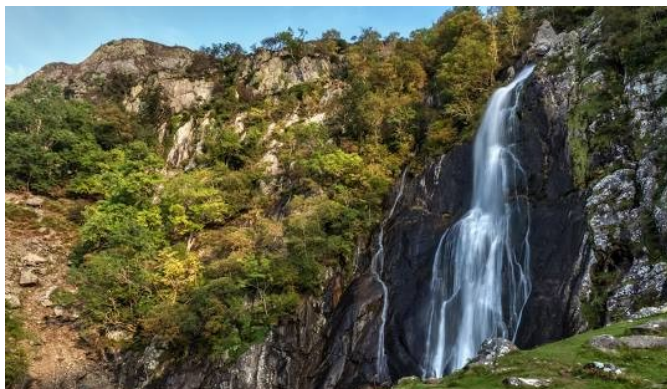
Rhaeadr Fawr (Aber Falls) with Marian Rhadr Fawr crags beyond

1) Llanfairfechan Coastal Circular & Aber Falls. Walk through Aber village on the N. Wales Path to car park (664719 for Aber Falls, then stay on road, crossing bridge & climbing steeply for ~1km to higher car park (676716) before heading N & E on the path (an old Roman Road) across open moorland to where it turns N at 693723. Descend to & through Llanfairfechan & return to Aber along the footpath that follows the coastline from 678754 to 647732, where you turn left to cross the railway line & A55(T) road. You should still have plenty of time to get to Rhaeadr Fawr (668700) & back.