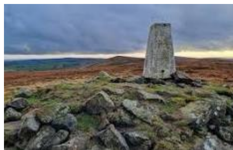
Axe Edge trig point

Cancellations after the Wednesday prior to the coach meet will still be charged £10 and failure to turn up without cancelling means the full coach fare will still be expected from you.