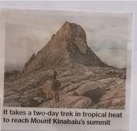
It takes a two-day trek in tropical heat to reach Mount Kinabalu's summit

Only those aged over 15 are given permits for the climb, which takes two days. Most climbers stay overnight on the mountain before striking for the peak at dawn, when the views are spectacular. Climbers without suitable clothing can find trouble on a journey that begins in tropical heat but can end in freezing temperatures at the peak.