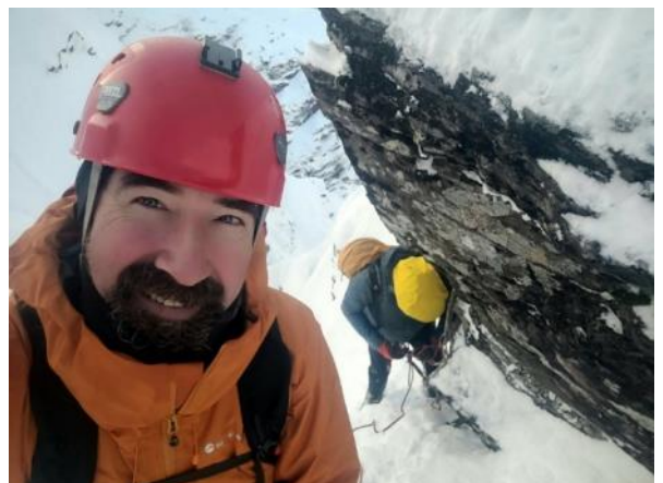
At the belay high on 'A Journey to the East, Coire an Dothaidh.