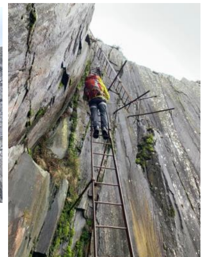
At the top left and on the cover you'll see Sentries Ridge, the other photos are of 'Snakes and Ladders', just a sample of the 280 or so photos we took!