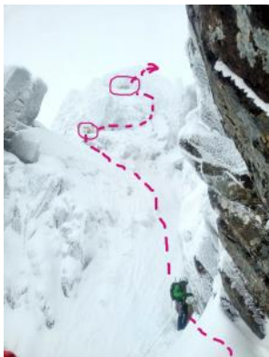
The top section of 'Raeburn's Route IV, Coire nan Lochan. Note the three groups on belays ahead of us.

At the belay high on 'A Journey to the East, Coire an Dothaidh.