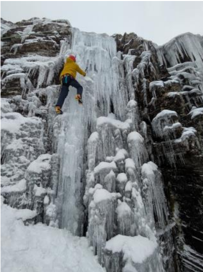
Top roping ice climbs in Coire Daimh

After breakfast we had a final briefing then headed towards Bridge of Orchy to walk up into Coire an Dothaidh. My groups target was a mixed / ice climb called Taxus III, 4 ***. After a much easier walk in than the day before we geared up in the Corrie