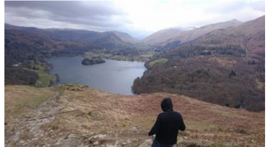
Rydal Water from Loughrigg

Ambleside Bus Station (LA22 0BZ or SD375044)