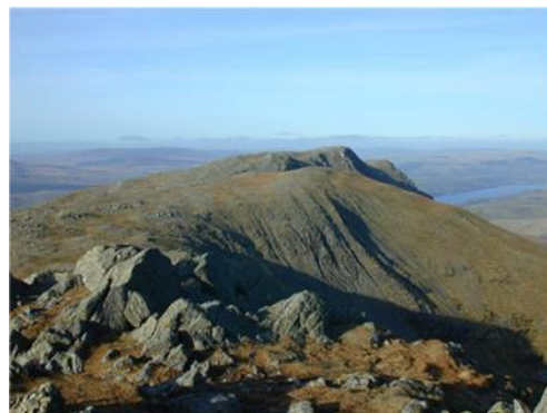
Aran Benllyn seen from Aran Fawddwy on a good day

Pick Ups: Dinas Mawddwy (Layby) (858147)