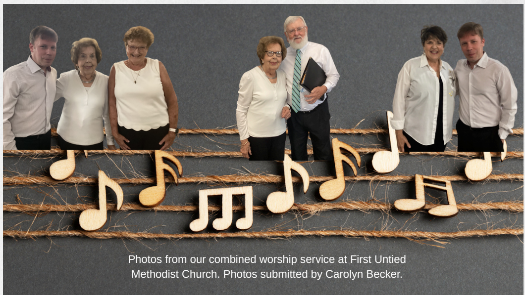
Photos from our combined worship service at First United Methodist Church.