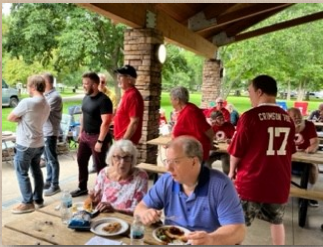
Worship and Picnic at Ritter Park