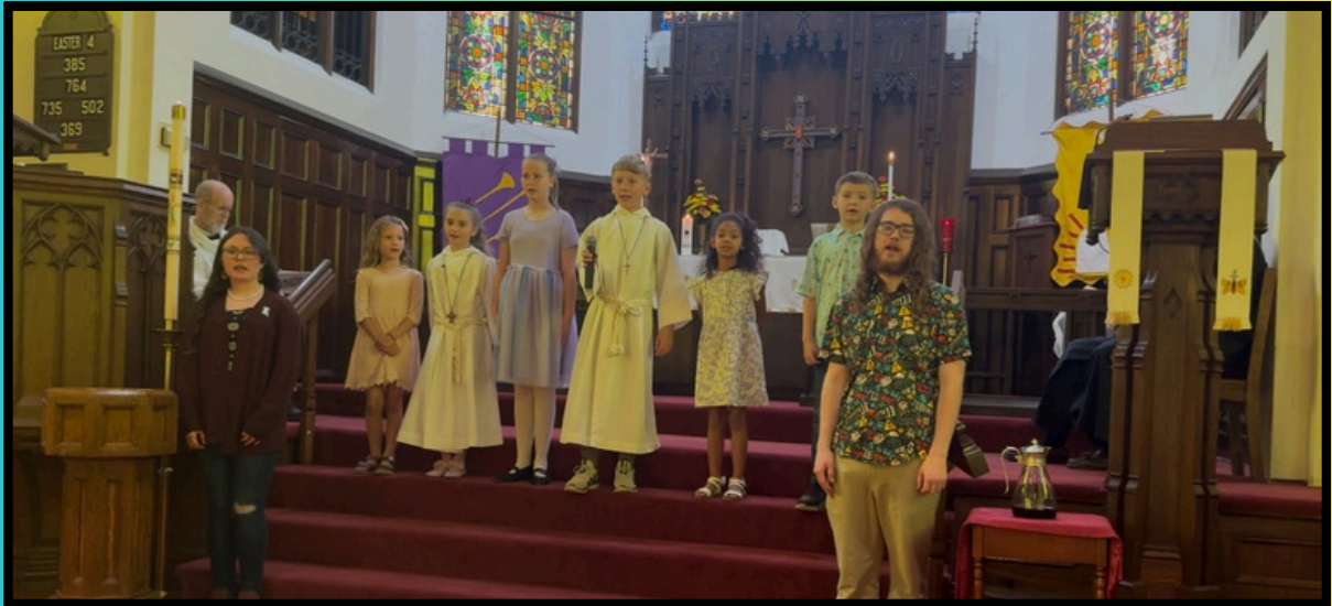
The youth sang a special song for Mother's Day.