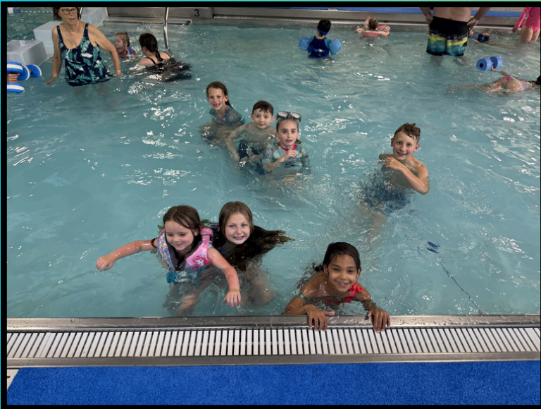
End of year pizza and pool party for the youth.