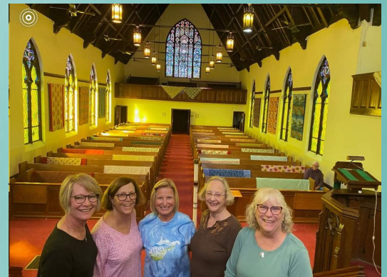
Blessing of the Quilts on November 12.