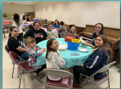
Veteran's Day and Friendsgiving