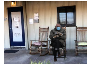
@ NTAC too??

If you chair a committee and want to included information in a future newsletter to create awareness and/or solicit participation, or just thank those serving on your committee, please send a brief synopsis similar to those above to ntacnewsletter@gmail.com .