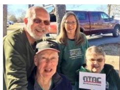
Graham's & Green's @ Ft Parker SP near Mexia TX.

Our social media accounts are something fun to do as a group and a way to get our name out to fellow Airstreamers. Visitors can use NTAC as a base while checking out the newly and largely expanded Magnolia Silos, visit three large area zoos, get a "NP Passport Stamp from the Mammoth Dig, or visit the Heritage Home sight, among many other activities in the area, and all without the nightmare of pulling a trailer through